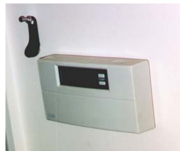
Thermochron next to a thermostat

We have grown to like tiny temperature recorders. They are very small and record over 2,000 time/temperature events. We can program to start at a specific time and to sample each one-minute interval, or up to each 255- minute interval. From the resulting charts, we can see how fast the air warms up, how fast it cools off, whether thermostats are working properly, temperature settings, and so on. If you would like us to record temperatures in your buildings, call us for an estimate. For example, if you wanted us to send you one recorder and then to send you a graph of the results after you returned it to us, we would charge you $50. ICE